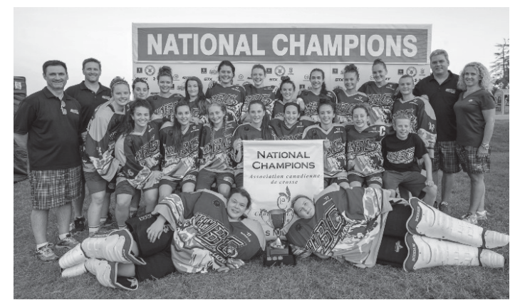
2014 Team BC Female Midget Team - Gold